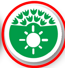
Energy / Climate