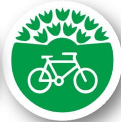
Mobility / Transport