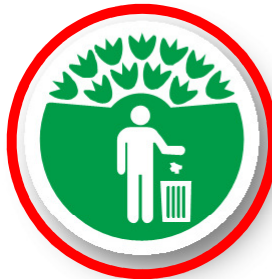
Litter / Waste

First 3 themes we are focussing on for our Bronze Award: