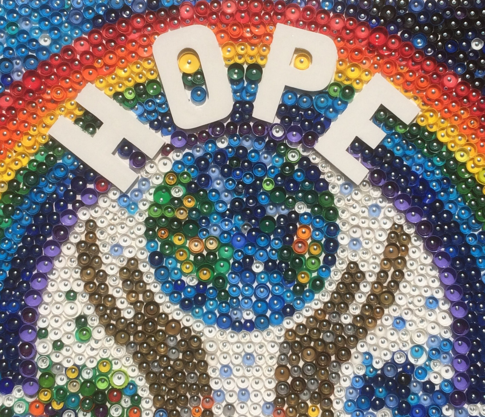
Art display created out of plastic bottle tops at St John Fisher Parish, Kearsley